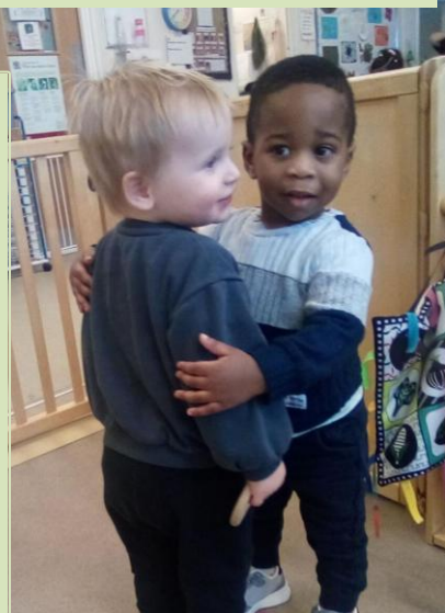
Developing motor skills

Take a look at some of the lovely activities on offer recently!