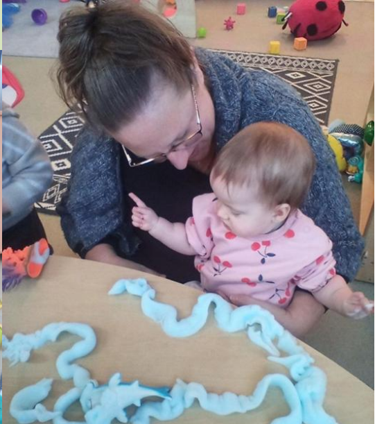
Building bonds with their key person and peers.