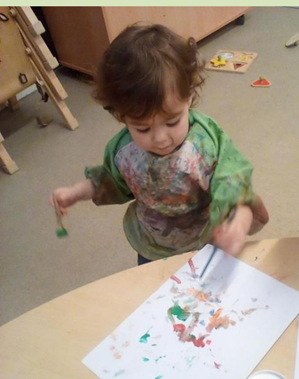
Tabletop activities to support standing.