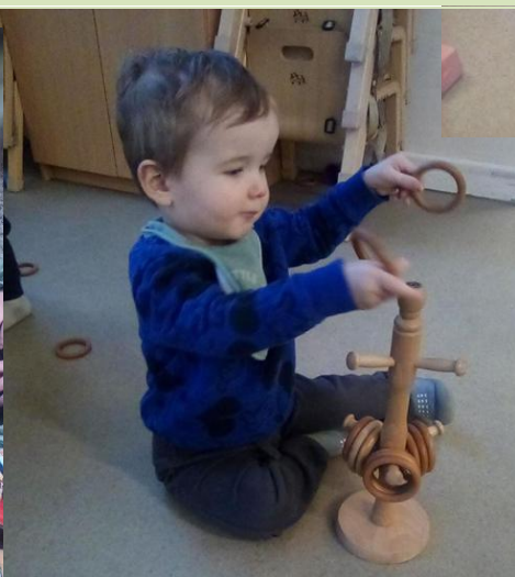
Gaining confidence to explore independently.