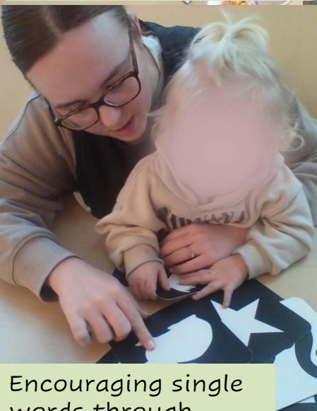
Encouraging single words through labelling objects.

In our Baby Unit we focus on supporting the development of the three prime areas.