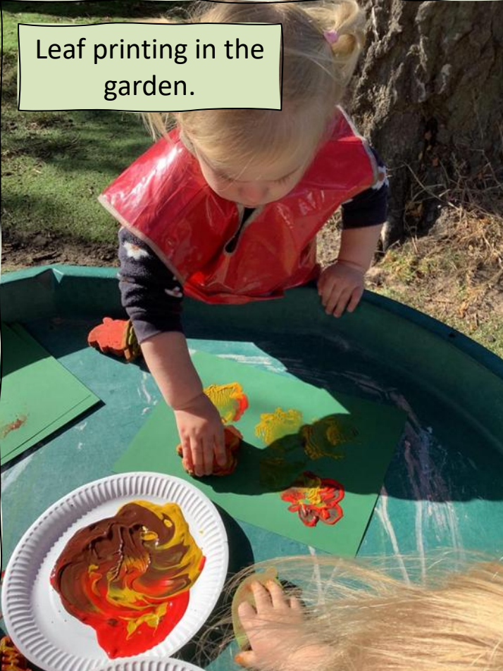
Leaf printing in the garden.