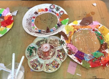
Lights and sensory exploration!