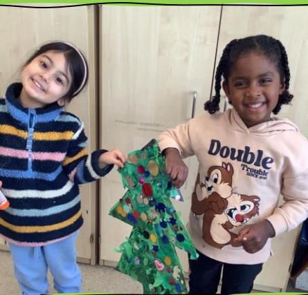
Working together as a team!