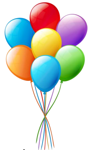
Imogen Aadhya Amellio