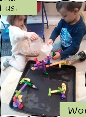
Working together to achieve a goal