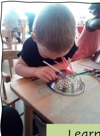
Learning to share resources