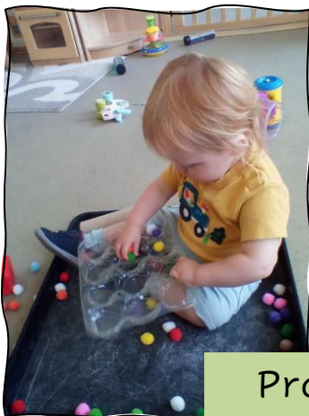
Promoting motor skills