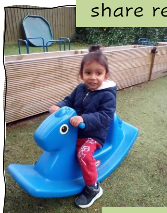
Promoting communication and language skills