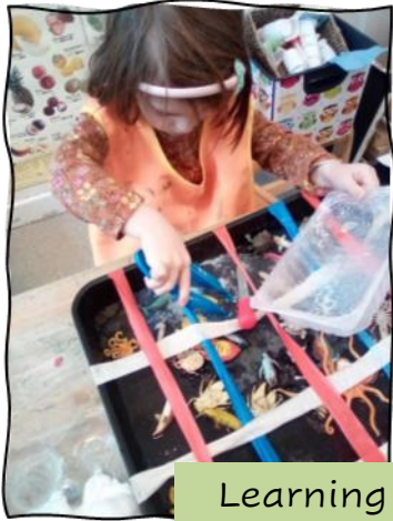
Learning about the world around us.