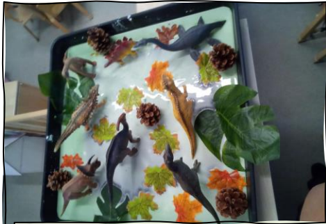
Learning through play