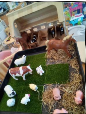
Promoting our imagination