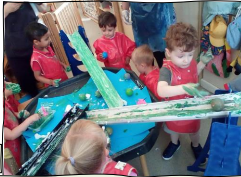
Experimenting with new concepts and ideas