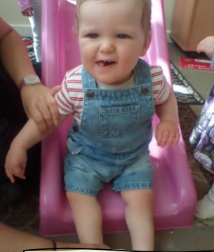
Extending motor skills